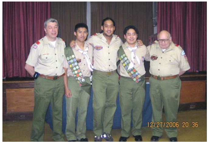
Double Eagles 2006 ↑ Summer Camp 2008 ↓