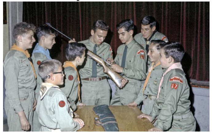
Troop Meeting ~ 1962 ↑ Western Trip – 1969 ↓