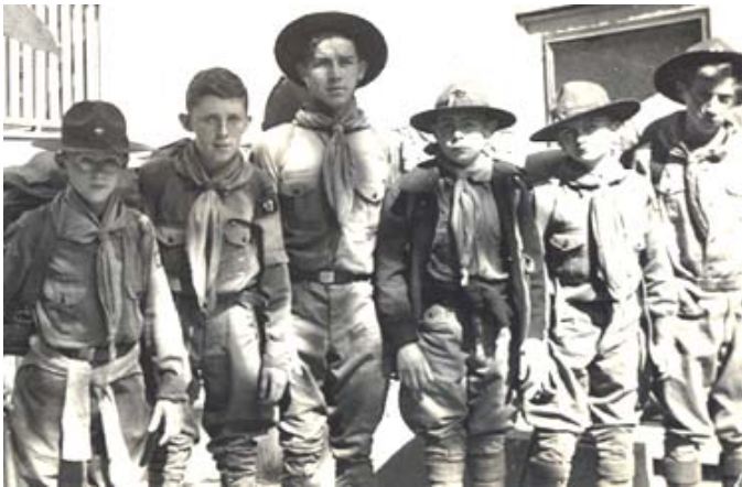
Outside Methodist Church ~ 1938