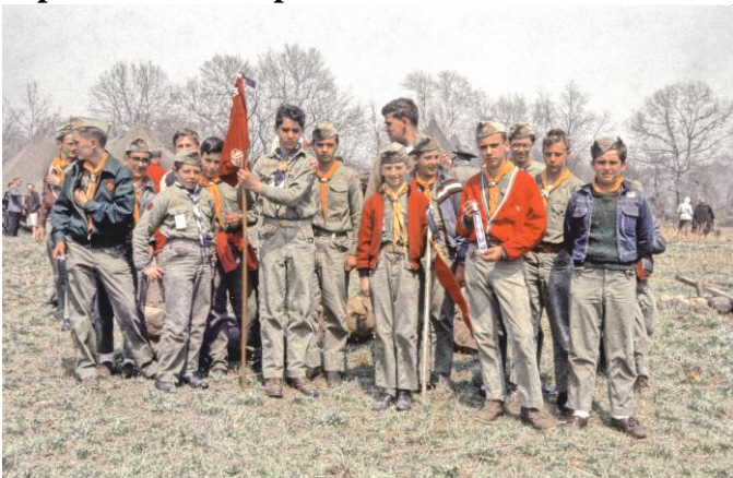
Camporee ~ 1960 ↑ Summer Camp - 1964 ↓