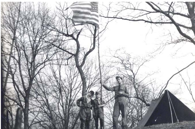
Cunningham Park ~ 1945