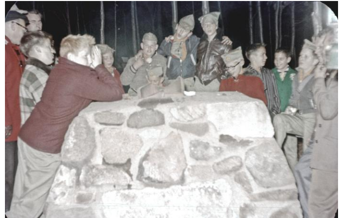
Father & Son Trip ~ 1958