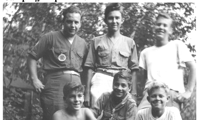
Camping Trip ~ 1949