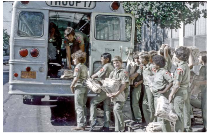
Newspaper Drive ~ 1973