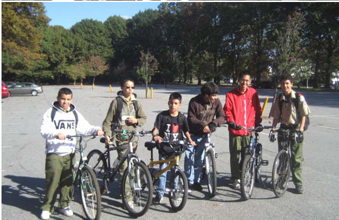
Bike Hike ~ 2008 ↑ TMR Winter 2012 ↓