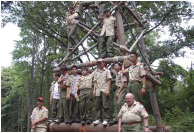
Alpine Tower ~ 2006 ↑ Shawnee Ski Trip 2007 ↓