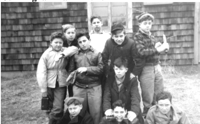
Camp Newcombe ~ 1947