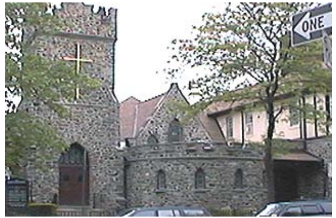
Baptist Church - 2002