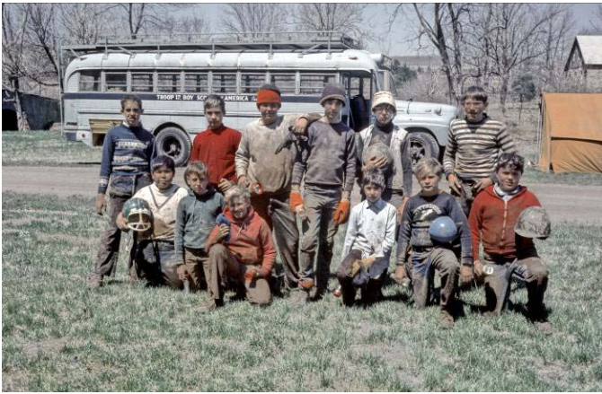
Caving at Kutztown ~ 1971