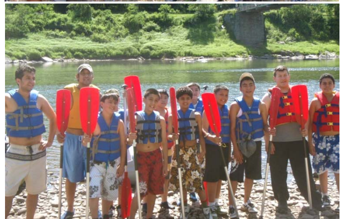
Delaware trip ~ 2010 ↑ Philadelphia 2012 ↓