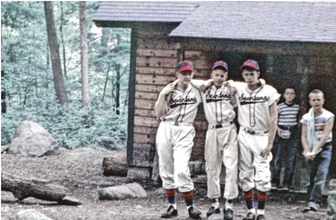
Alpine Scout Camp ~ 1955