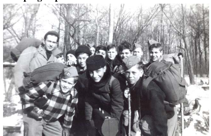
Camping Trip ~ 1946