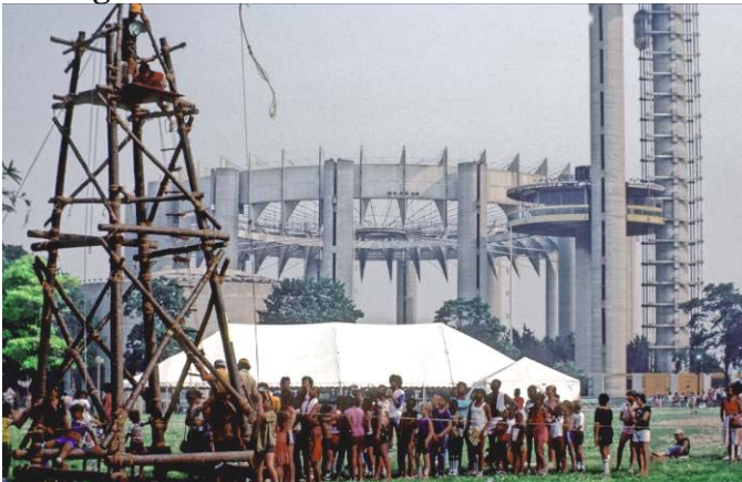
Queens Day ~ 1984