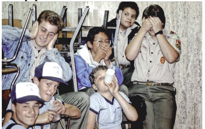
NYC Day Hike ~ 1986