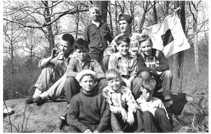
Alpine Scout Camp ~ 1952