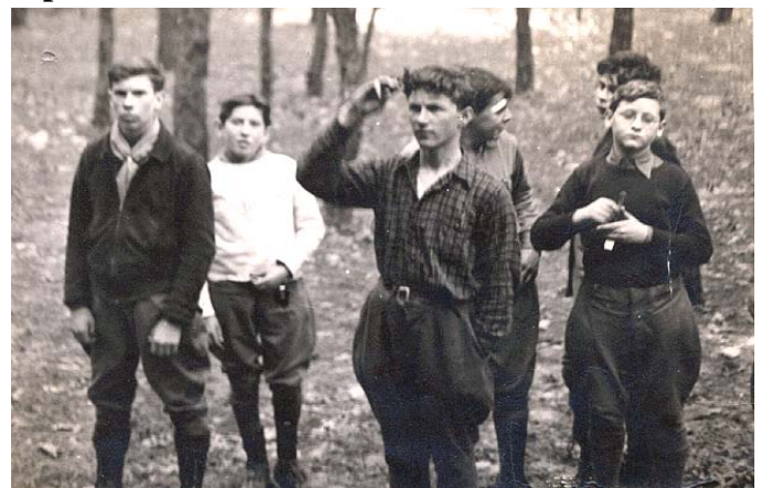
Camping trip ~ 1941