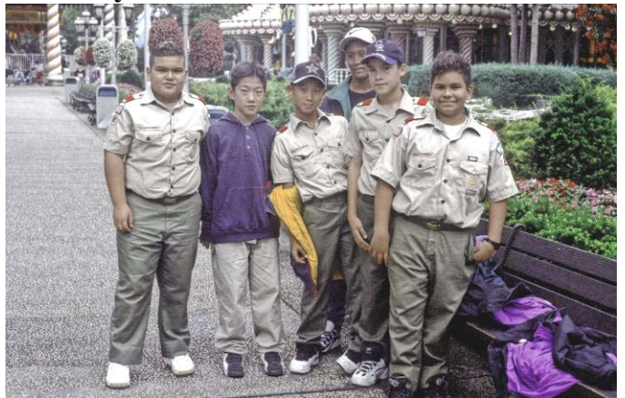
Hershey Park ~ 1995 ↑ Okefenokee Swamp 2003 ↓